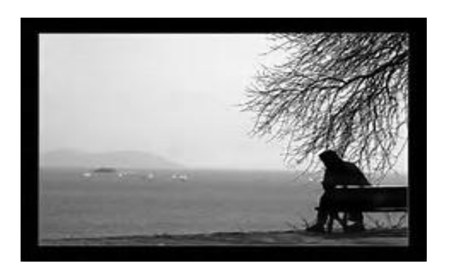
曾經一刻漆黑裡幻想 没有信仰可會是哪模樣 There was a moment in darkness. Without faith, I imagined how life was like.