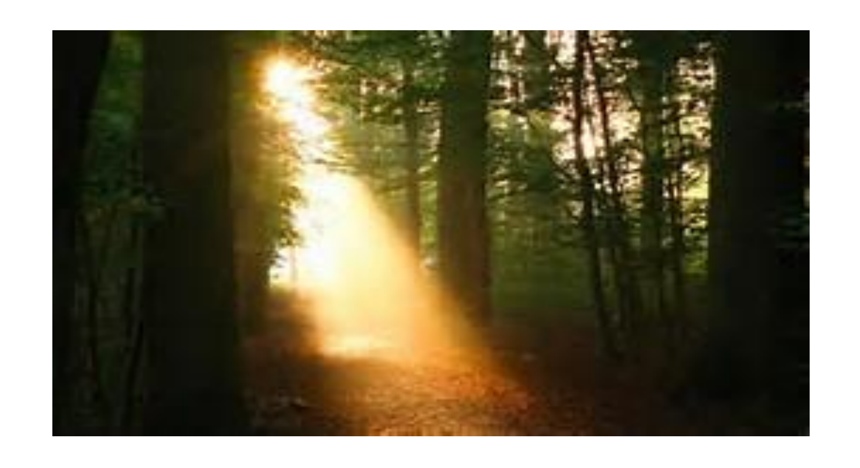
如今一刻不需再幻想 和祢拼搏不怕路遠夜長 Now I don't need to imagine and wrestle with You. I am not afraid of the long road and night.