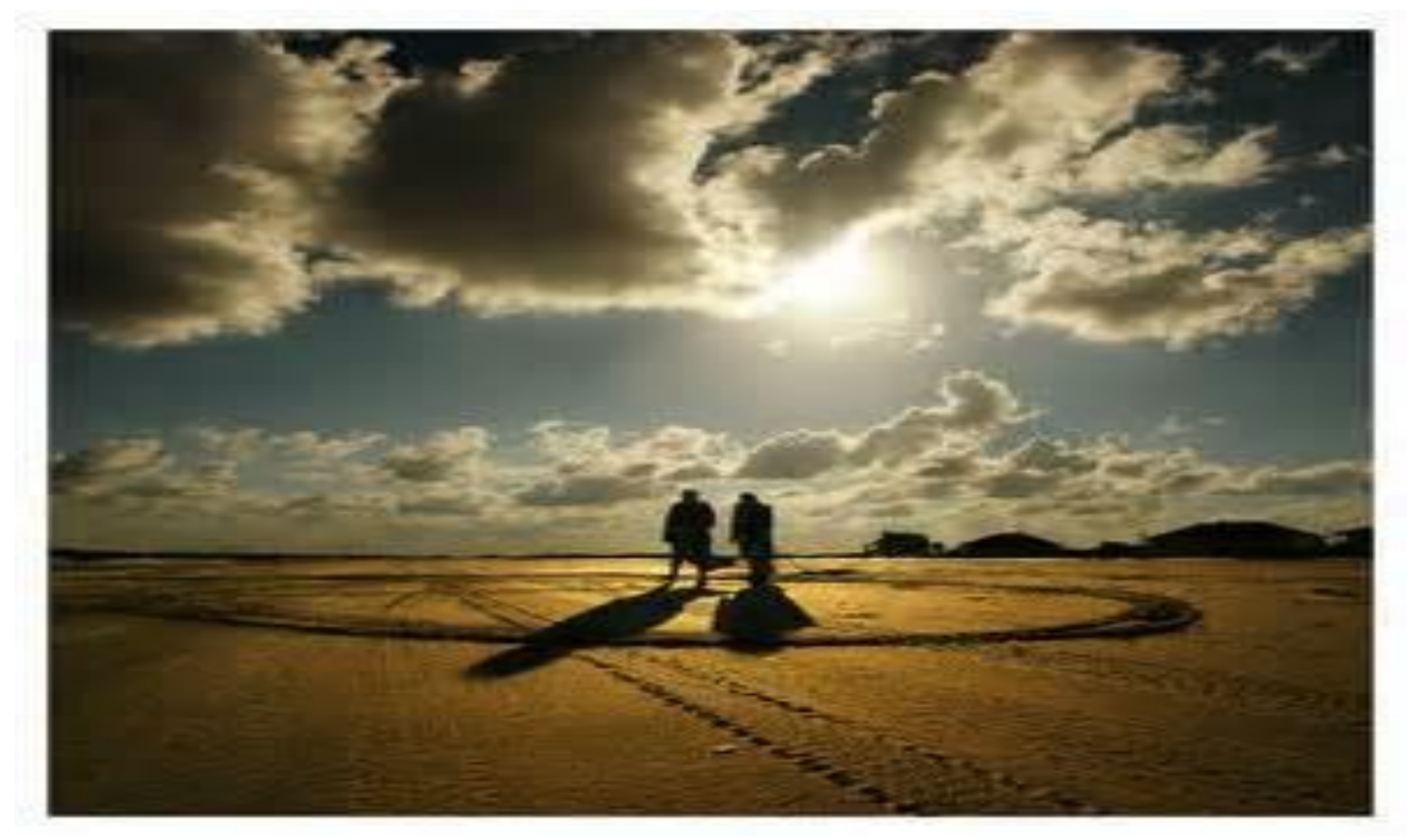
神定會為我開路 堅穩信心盼望 尤像以諾與主同行

God will provide for me. Hold firm my faith and hope, just like Enoch's walk with HIM.