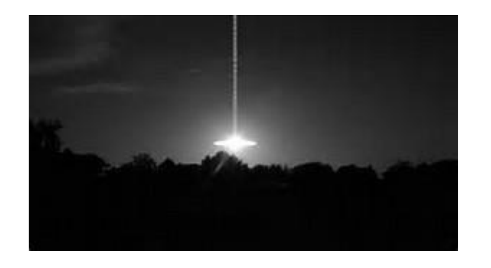
曾經在俗世中打轉未見曙光 耶穌原是每刻在旁 Once, I was circling around with no hope. Yet, Jesus had been with me along the way.