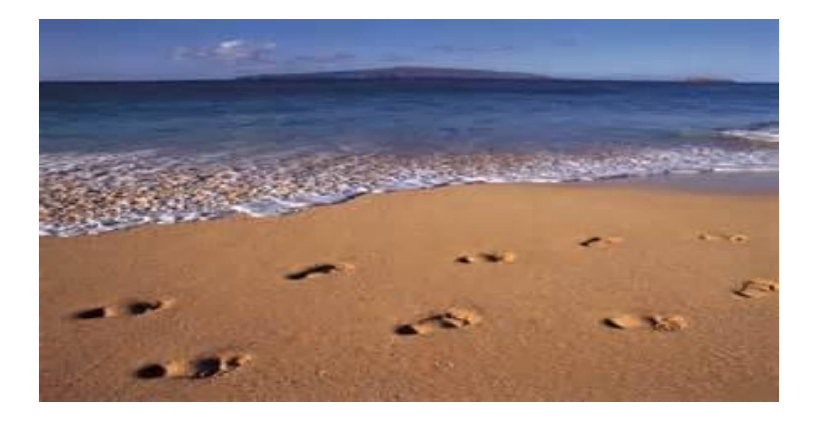
曾經在俗世中打轉未見曙光 耶穌原是每刻在旁 Once, I was circling around with no hope. Yet, Jesus had been with me along the way.